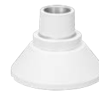
WV-QSR506F1-W Mount Bracket